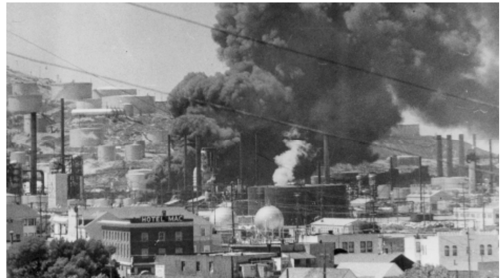
Richmond Refinery Fire, September 1958