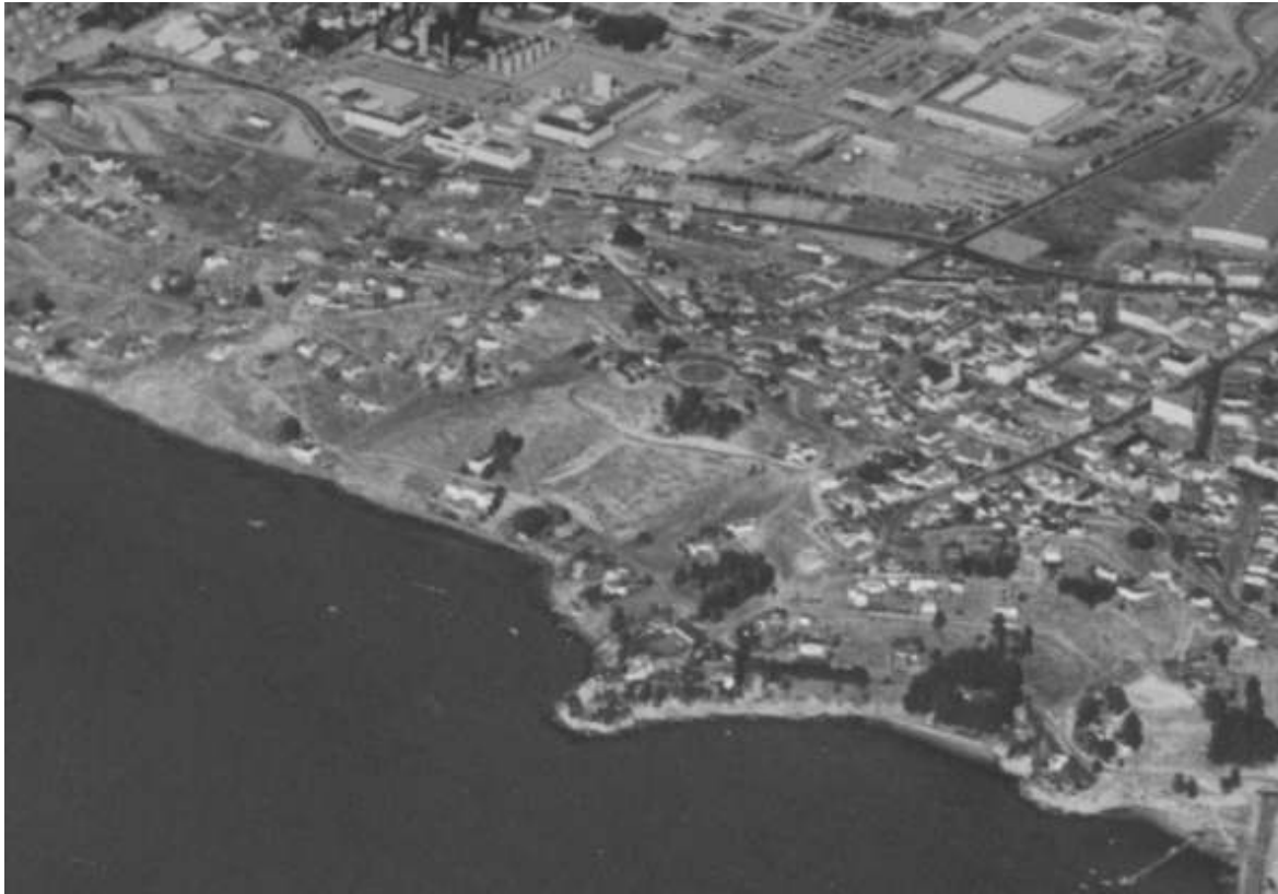
Aerial photo of Point Richmond taken in January of 1949