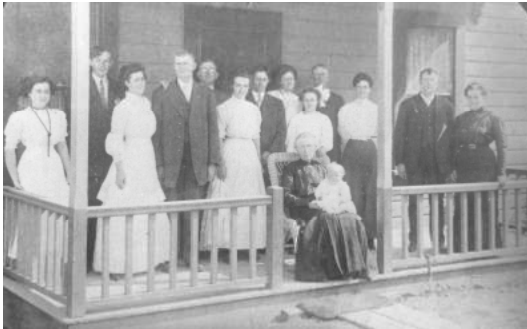
A Whiteside family gathering - 1911