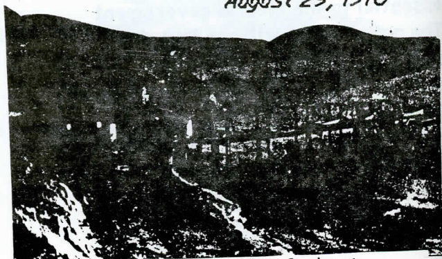
Kellers Beach and Wharf about 1915 just after tunnel was finished